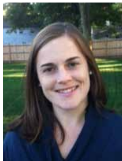
Lynne Lofberg Primary 1