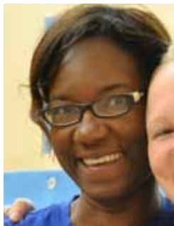
Hyacinth Ellis Upper Elementary