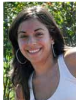
Voula Coss Primary 1 Staff Appreciation