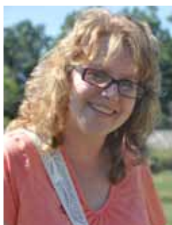
Ann Osoba Primary 2