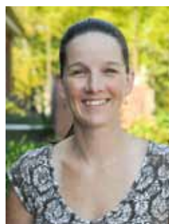
Brook Kokus Toddler 2