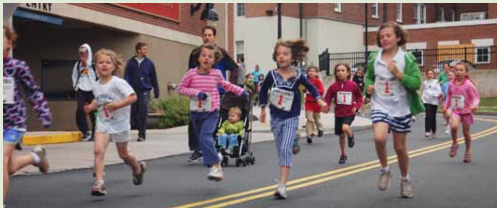
MSGH Alumnae enjoying the Celebrate West Hartford Race in Blue Back Square