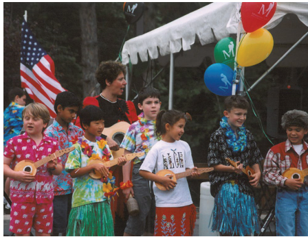
▲ Our 40th Anniversary Celebration