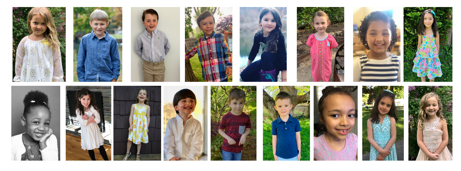
3RD YEAR ELEMENTARY CHILDREN