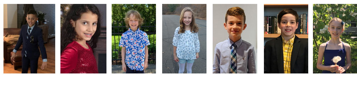
6TH YEAR ELEMENTARY CHILDREN